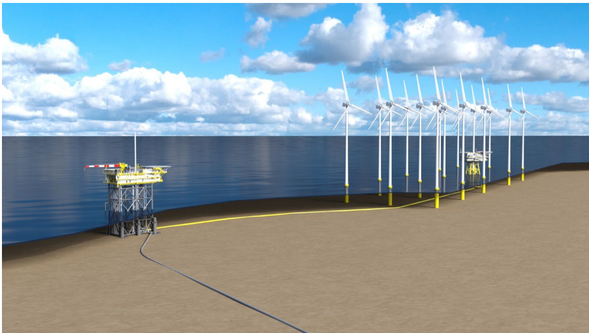
Visualisation platform N05-A and connection to wind farm Riffgat